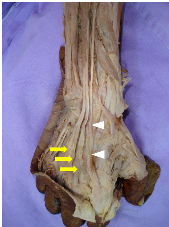
Figure 2. Tendons of extensor digitorum muscle (arrows) and accessory muscle (arrow heads)