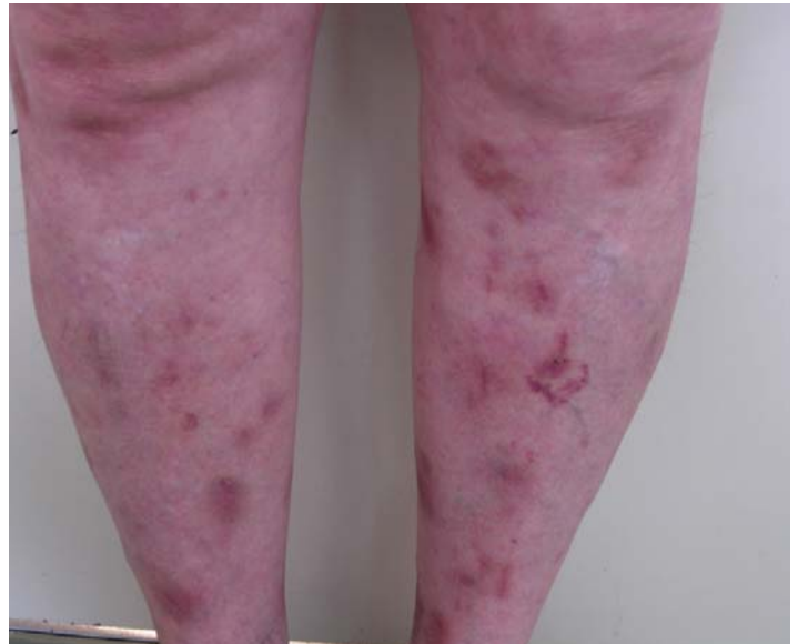
Figure 1: Multiple ecchymoses on the lower legs.

A 63-year-old woman presented with a two-year history of recurrent episodes of painful ecchymotic lesions over the anterior aspects of the arms and legs. The lesions were sudden in onset, recurring every few weeks, and not associated with injury, self harm, insect bites, or intake of drugs. The patient's major complaint was pruritus. The onset of lesions was usually preceded by intense pruritus, tingling, pain, and tenderness in a localized area. The patient had received various kinds of antihistamines, and topical and oral corticosteroids without any benefit. Her past medical history included depression and panic attacks. She had received many drugs for these diseases. Lastly, alprazolam was suggested but she had given up a month before. The patient's own theory about the reason for the occurrence of the lesions was stress. A cutaneous examination revealed ecchymoses varying in size from 1 to 3 cm, excoriations,