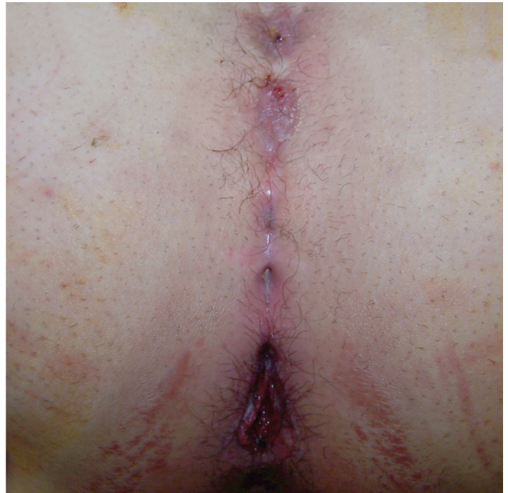
Figure 1: Preoperative view of the long pilonidal sinus, extending from just above the anus to the upper intergluteal sulcus.

A deep, wide intergluteal defect was estimated after the complete excision of the sinus, therefore a left hip superior gluteal artery pedicled perforator flap was planned.