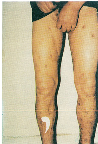
Fig. 1AB: Typical skin lesions of the addicts.