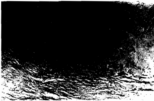
Fig. 1: Low-power picture shows nodular growth pattern characterized by uniform hyalinized lobules separated by spindle cells (H&E x40).

1). The centre of the nodule is more cellular than its periphery and associated with cleft-like, richly vascular areas. Some of the spindle cells are in lacunes. The nuclei are slender and serpentine-like (Fig. 2).