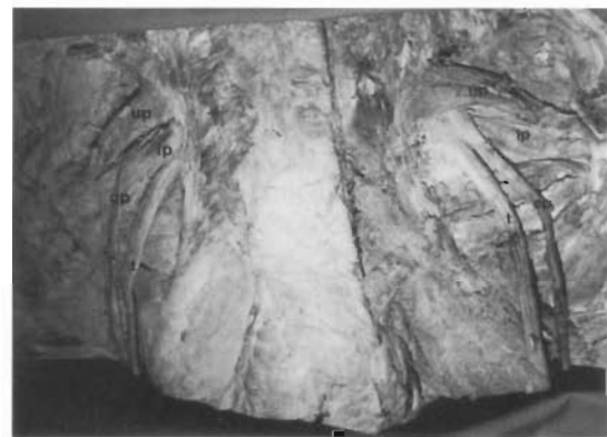
Fig. 3: Photograph showing divided piriformis muscle and the high dividing sciatic nerve passing between the two portions of the piriformis muscle bilaterally.

muscle originated from the anterior surface of the sacrum and the lower portion from the lower part of the anterior surface of the sacrum and the sacrotuberous ligament. The insertions of these two portions were to the greater trochanter of the femur. These two portions were innervated by the branches emerging from the sacral plexus. Interestingly in this case, all the variations were observed bilaterally (Fig. 3).