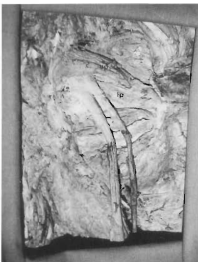
Fig. 2: Photograph showing divided piriformis muscle and the high dividing sciatic nerve passing between the two portions of the piriformis muscle in the right gluteal region.

muscle originated from the anterior surface of the sacrum and the lower portion from the lower part of the anterior surface of the sacrum and the sacrotuberous ligament. The insertions of these two portions were to the greater trochanter of the femur. These two portions were innervated by the branches emerging from the sacral plexus. Interestingly in this case, all the variations were observed bilaterally (Fig. 3).