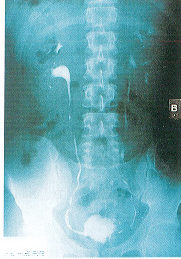
Fig - 1 : Appearance of copper wire on abdominal x-ray (A) and excretory urography (B).

Correspondence to : Dr. Bora KÜPELİ Beyazgül sitesi A - 1 / 21 Ümitköy 06530 ANKARA - TURKEY Phone : 312 - 214 10 00 / 6232 Fax : 312 - 212 90 21