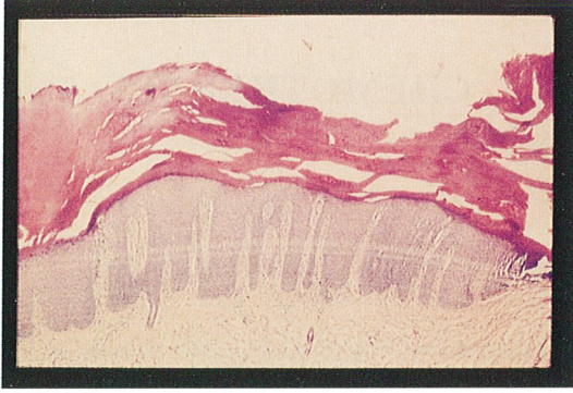
Fig - 3 : Typical histopathological appearance for psoriasis.