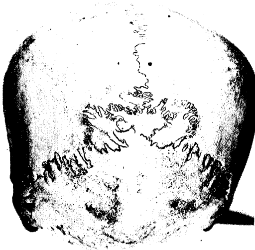
Fig - 2 : Multiple preinterparietal bones.