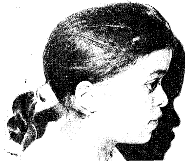
Fig - 3

tebra. There were no pathologic signs on intravenous pyelography (IVP), abdominal ultrasonography, electroencephalogram, VUCG, computed tomography of brain, pituitary gland and abdomen. Bone age was 11 years (6).