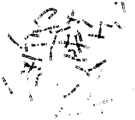
Fig - 1 : Metaphase plaque (GT - banding).